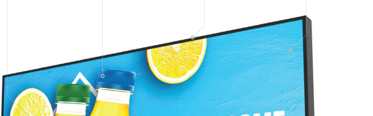
24/7 IPS PANEL